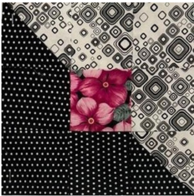
By Kandis Kile