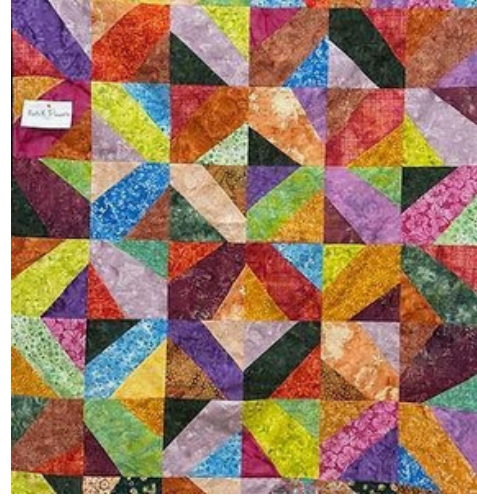
By Judy M. and Jeannie

1 entry = 3 blocks * 2 entries = 6 blocks. You will be cutting 6 blocks at a time. To slice your six 10" flower-colored batik blocks, make a slanted cut to the left side, then to the right side, leaving a fan-shape center (See sample on website or above). You must keep the set of 6 as a unit. If you make more, keep each set of 6 together because of the way each set is cut a bit differently. See Sunbeam Fabric Art's video link and another video made by Jeannie.